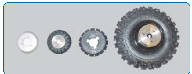
Multiple wheel sets are available to maximize bottom-clearance, traction, and optimum camera position!