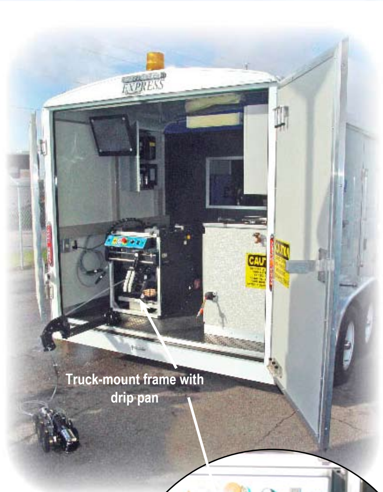
Truck-mount frame with drip pan

This document provides specifications and available configurations for the equipment listed above.