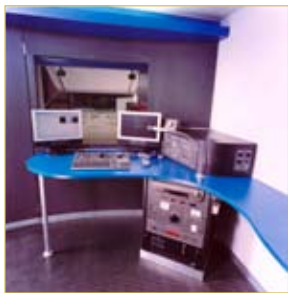
VIEWING ROOM WITH ADDITIONAL COUNTERSPACE