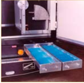
4' DRAWERS WITH EXTENSION SLIDES

Evolution Series I Interior - most vehicle-mounted units are available with the state of the art Evolution Series I Interior, featuring an ergonomic design to achieve ease of operation, safety, and convenient storage to produce the most efficient, rugged, and reliable system in today's market.