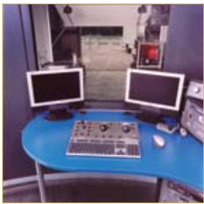
VIEWING ROOM FLAT SCREEN MONITORS