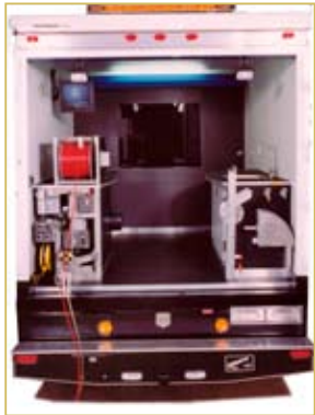
EQUIPMENT ROOM WITH LARGE VIEWING ROOM WINDOW