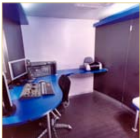
VIEWING ROOM WITH INDIRECT LIGHTING